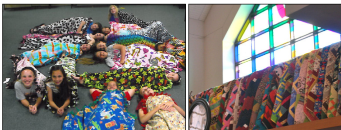
(left) The sixth grade girls made blankets for the children in Honduras.

Thank you for your support, and please pray for this team as they reach out to our brothers and sisters in Honduras.